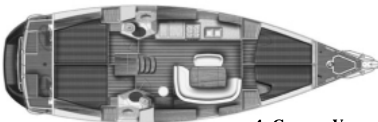
4 CABIN VERSION